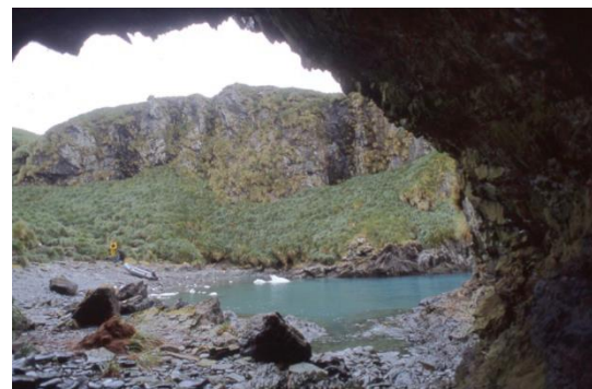
View from inside the cave

Extensive kelp beds, hazardous rocks and reefs lie immediately offshore.