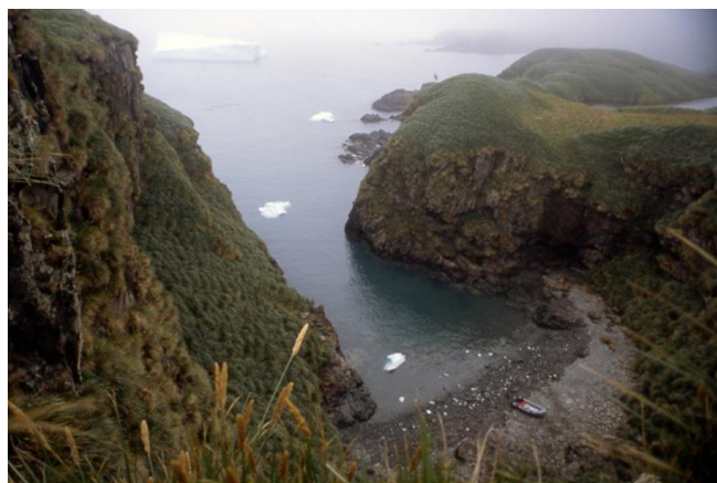
Cave Cove showing the landing beach and cave

It is therefore prohibited to follow the old route up the gully to the saddle until further notice.